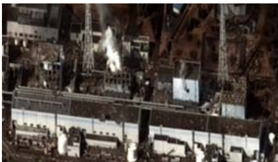
Fukushima nuclear reactors

Japanese nuclear crisis. As a beta emitter, iodine-131 causes mutation and death in cells which it penetrates and adjacent cells up to several millimeters away. These