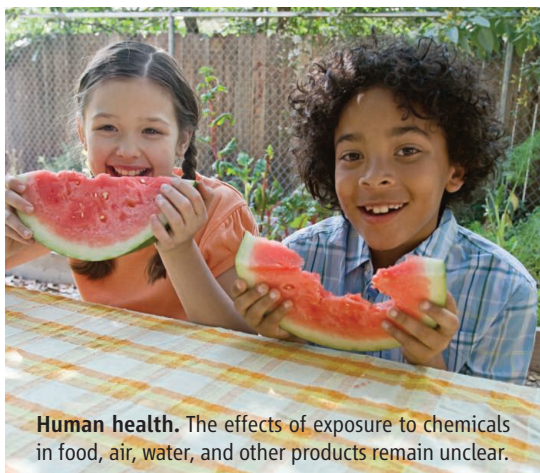
Human health. The effects of exposure to chemicals in food, air, water, and other products remain unclear.

THE EFFECT OF ENVIRONMENTAL EXPOSURES ON HUMAN HEALTH IS A GROWING AREA OF concern. The number of new chemicals is increasing exponentially, with approximately 12,000 new substances added daily to the American Chemical Society's CAS registry (1). Although only a portion of these chemicals are introduced into the environment, data on the hazard posed by even high-production volume (HPV) chemicals (those with a production volume exceeding 1000 tons/year) are available for only a fraction of the HPV chemicals produced or imported