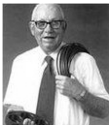
Roy J. Plunkett

In 1968, organofluorine content was detected in the blood of consumers, and in 1976 it was suggested to be PFOA or a related compound such as PFOS. In 1997, 3M detected perfluorooctanesulfonic acid (PFOS) in blood from global blood banks. In 1999, the US Environmental Protection Agency began investigating perfluorinated compounds after receiving data on the global distribution and toxicity of PFOS, the key ingredient in Scotchgard. For these reasons, and US EPA pressure, the primary American producer of PFOS, 3M, announced in May 2000 the phaseout of the production of PFOS, PFOA, and PFOS-related products. Advances in analytical chemistry demonstrate the routine detection of low- and sub-ppb (parts per billion) levels of PFOS in food, wildlife and humans. In animal studies, PFOS is linked to cancer, physical development delays, endocrine disruption and neonatal mortality. Female mice with blood levels of PFOS within ranges found in wildlife and humans demonstrated higher mortality when infected with influenza A, indicating immune-system effects. PFOS reduces the birth size of animals, raising concerns for humans.