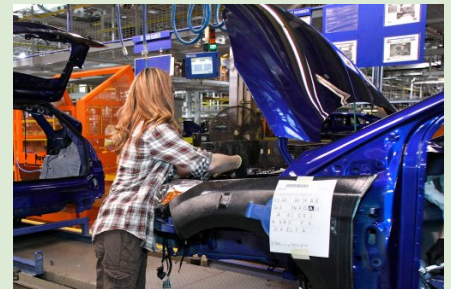
A worker builds a Ford Focus on the assembly line at the Ford Motor Co.'s Michigan Assembly Plant Dec. 14, 2011, in Wayne, Mich.